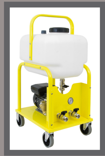
Solarfill pump set