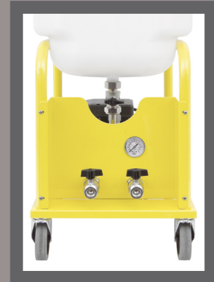
Solarfill pump set front view