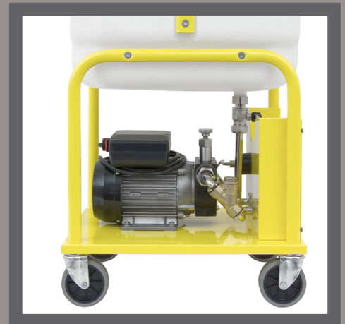
Solarfill pump set side view