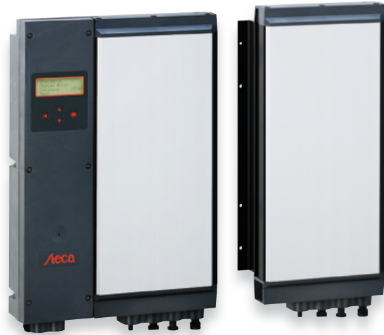
StecaGrid 2000+ Master